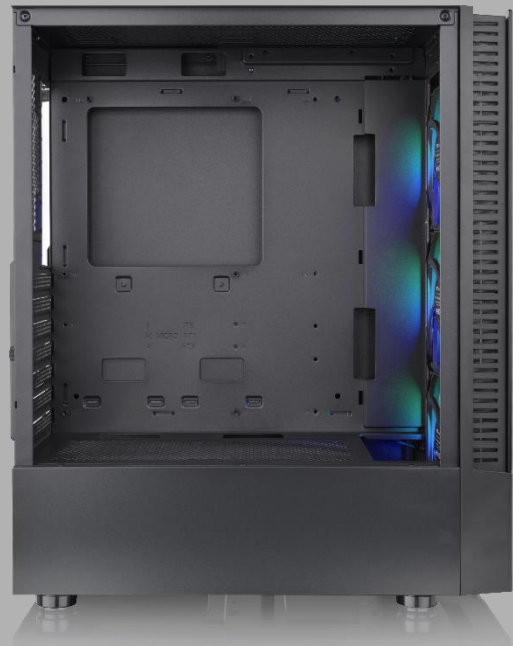
Full length power cover